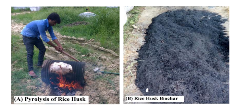
Fig. 1: Production of rice husk biochar by drum method as described by Srinivasarao et al.<sup>23</sup>

Rice husk procured from rice mill from the Lucknow area was used for the RHB production in the presence of partial supply of oxygen, called as pyrolysis (Figure 1). The pyrolysis carried was out in open environmental condition near to the experimental field site by drum method as described by Srinivasarao et al <sup>23</sup>. In brief a 50 kg capacity-drum was moderately filled with rice husk and heated for 30 minutes on 250 °C. Again after 40 minutes, the temperature was increased up to 300 °C for the production of precious quality of biochar<sup>24</sup>. After some time this the temperature was kept constant for few minutes and after 30 minutes the drum was left for cooling and dark-black colour RHB (Figure 1B) was harvest in container for the application in experimental field.